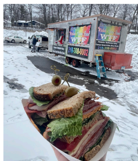
Theresa's Wicked Tasty Food

* Dates are subject to change. Follow the Mille Lacs Energy Cooperative Facebook page for updates/ cancellations*