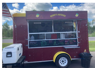
Benny's Hotdogs & Lemonade